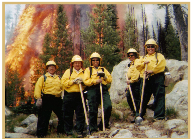
Apache 8 crew on a fire.