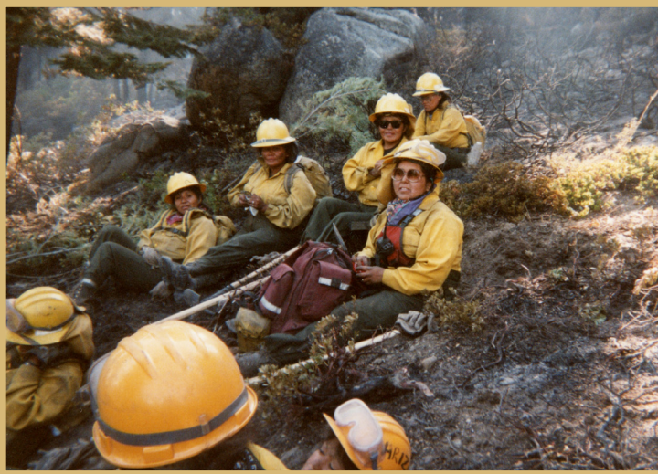
The Apache 8 crew pauses during another long day.