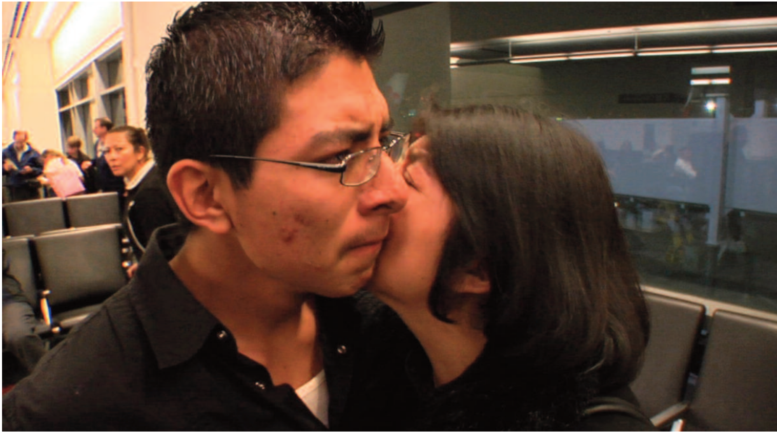
Tearful goodbyes at the airport