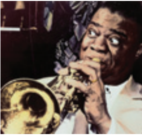
Louis Armstrong plays his trumpet during a performance in Baltimore.

1. Music has always been a component of American society, from folk songs and slave spirituals to jazz, rhythm and blues. Online or at the library, ask students to find a historic song or a few songs from a historic