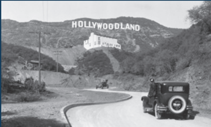
Vintage car moving on the road, Mulholland Drive, Hollywood, Los Angeles, California, USA, 1924