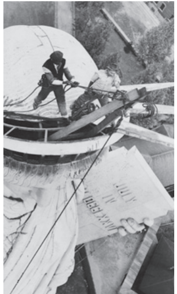
Renovation Work on Statue of Liberty. This picture was taken from the torch which she holds. Sept 26th 1938.

America The Story of Us offers educators and students an extraordinary opportunity to connect with the American past, learning about fascinating individual stories while envisioning a broad view of U.S. history. The 12 episodes in this series provide a roadmap for learning about U.S. history, with stories