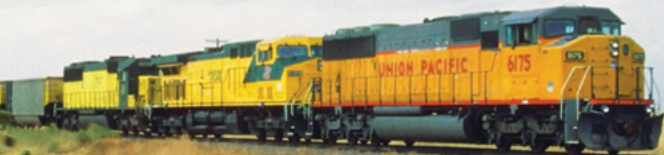
Freight train passing through a field, North Dakota, USA.