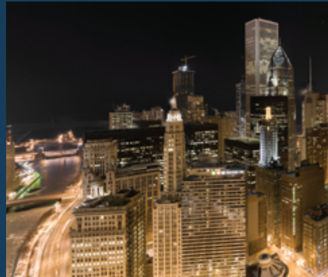
Large aerial view of the River East section of downtown Chicago at night.