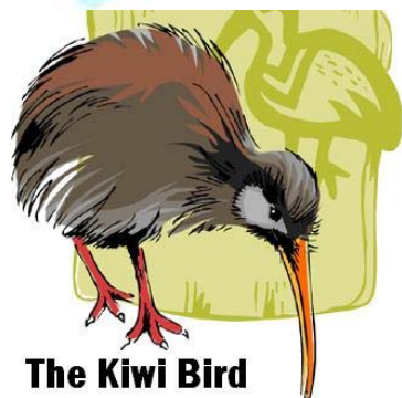
The Kiwi Bird